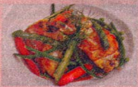
Roasted Chicken: $14