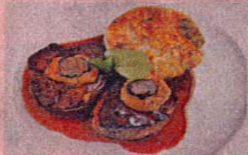
Tournedos Rossini: $26